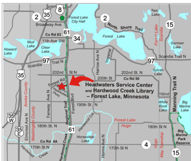
Headwaters Forest Lake Service Center 19955 Forest Road North, Forest Lake